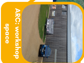
ARC: workshop space