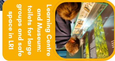
Learning Centre and Museum: toilets for large groups and safe space in LRI