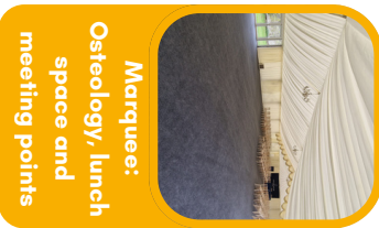
Marquees: Osteology, lunch space and meeting points