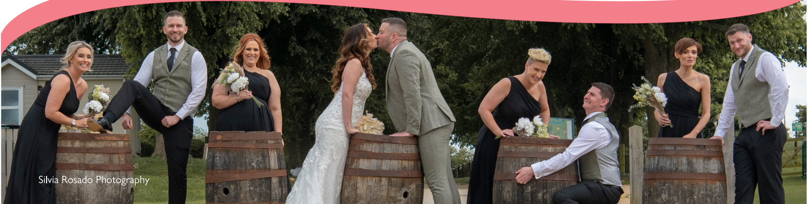
Silvia Rosado Photography

Monday to Thursday - from £2,500 Friday to Sunday - from £3,500